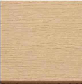
FLOORING White Oak Natural Engineered Hardwood