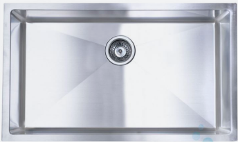
KITCHEN SINK Undermount Stainless Steel