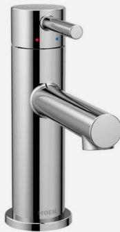
VANITY FAUCET MOEN Align One Handle High Arc Chrome