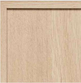
CABINET Sheer Beauty