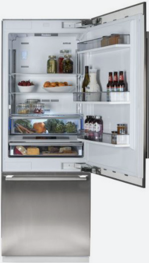
FRIDGE 24" Blomberg Fridge

ENJOY THE EASE AND LUXURY OF LIFE WITH THE HELP OF MODERN APPLIANCES