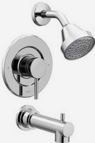
MAIN BATH SHOWER MOEN Align Chrome