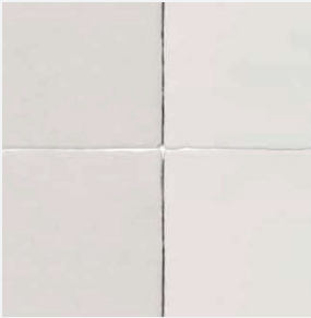
BACKSPLASH 5x5 Artisan White Glossy