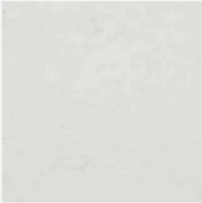
MAIN BATH COUNTERTOP Frosty Carrina Quartz