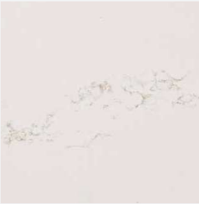
COUNTERTOP Strato Quartz with Waterfall End