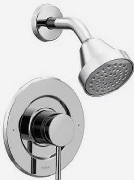
ENSUITE SHOWER MOEN Posi-Temp Chrome