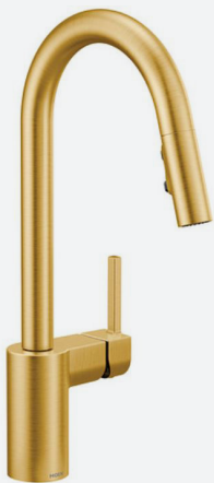
KITCHEN FAUCET MOEN Align 1-Handle Lever Kitchen Faucet Brushed Gold