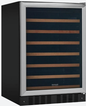
BAR FRIDGE Frigidaire Gallery 5.3 cu. ft.