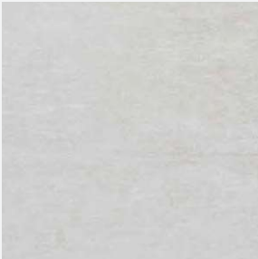
BATH FLOOR Westside White