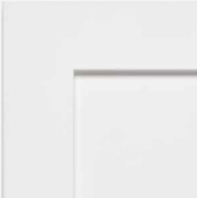
PERIMETER CABINETS Shaker