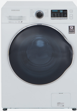
WASHER 24" Samsung Washing Machine