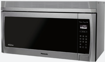
MICROWAVE Panasonic Over The Range Microwave