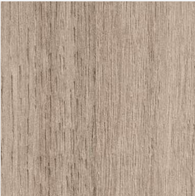
ISLAND CABINETS Woodgrain Chameleon