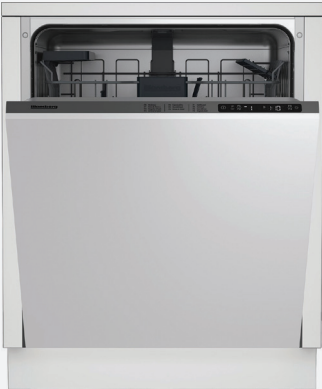
DISHWASHER 24" Blomberg Tall Tub Panel Ready Dishwasher