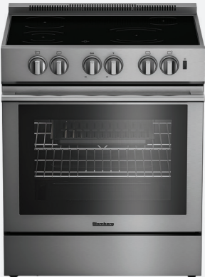
OVEN 30" Blomberg Slide-In Electric Range