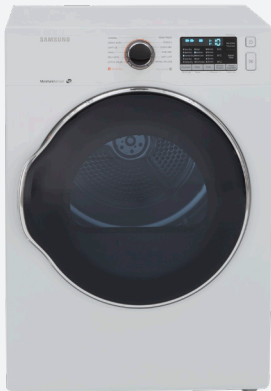
DRYER 24" Samsung Dryer